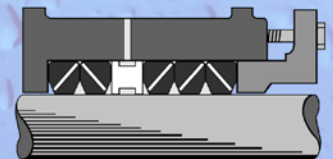
FIG.2: Seal Water Injection shaft, rod or valve stem with lantern ring & seal water

Contact Us To Learn More About Our Unique Products